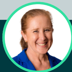
Prof Simone Strasser

The event fosters cross-disciplinary collaboration, bringing together a wide range of voices in the service of adults and children affected by liver disease. It is a dynamic forum for clinical education and open discussion, with ample opportunity to network with fellow delegates working across the spectrum of hepatology.